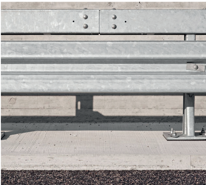
Fastening of crash barrier systems