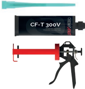
Injection mortar and accessories