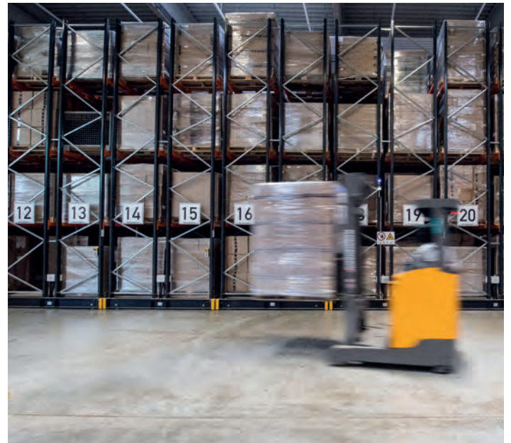
Fastening heavy duty shelving